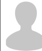
Vacant Executive Director of Resources and Transformation.